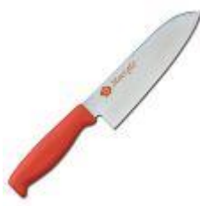
SC-711 Santoku (Red) 170mm