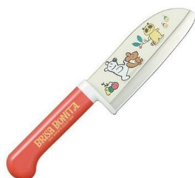
BB-3 Cooking Knife (Red) 115mm