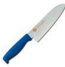
SC-721 Santoku (Blue) 170mm