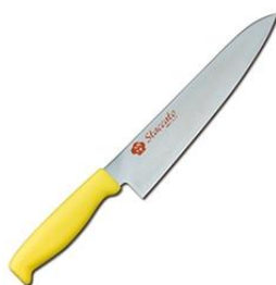
SC-702 Chef Knife (Yellow) 210mm