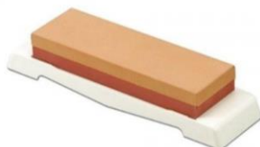
F-433 Combination Whetstone (#1000/#3000)