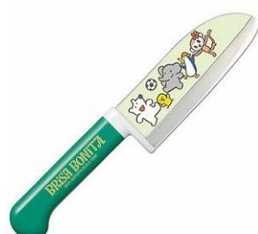
BB-4 Cooking Knife (Green) 115mm