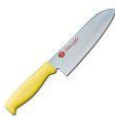
SC-701 Santoku (Yellow) 170mm