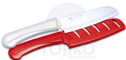
FK-431 Fruits Knife with Sheath (Red) 95mm