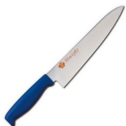
SC-722 Chef Knife (Blue) 210mm