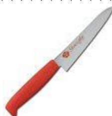
SC-710 Petty Knife (Red) 120mm