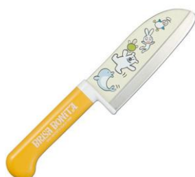
BB-10 Cooking Knife (Yellow) 115mm