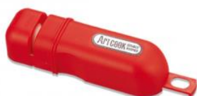
FK-436 Rolling Sharpener (Red)