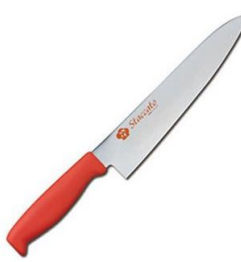
SC-712 Chef Knife (Red) 210mm