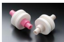
F-411 Exclusive Spare Whetstones Set for F-461

Size : 205 x 75 x 75mm Weight : 290g Barcode : 4 960375 136413