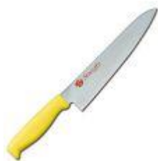
SC-700 Petty Knife (Yellow) 120mm