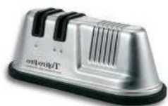
F-641 18-8 Stainless Steel Double Rolling Sharpener

Size : 205 x 75 x 75mm Weight : 290g Barcode : 4 960375 136413