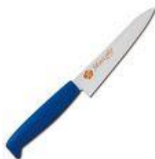
SC-720 Petty Knife (Blue) 120mm